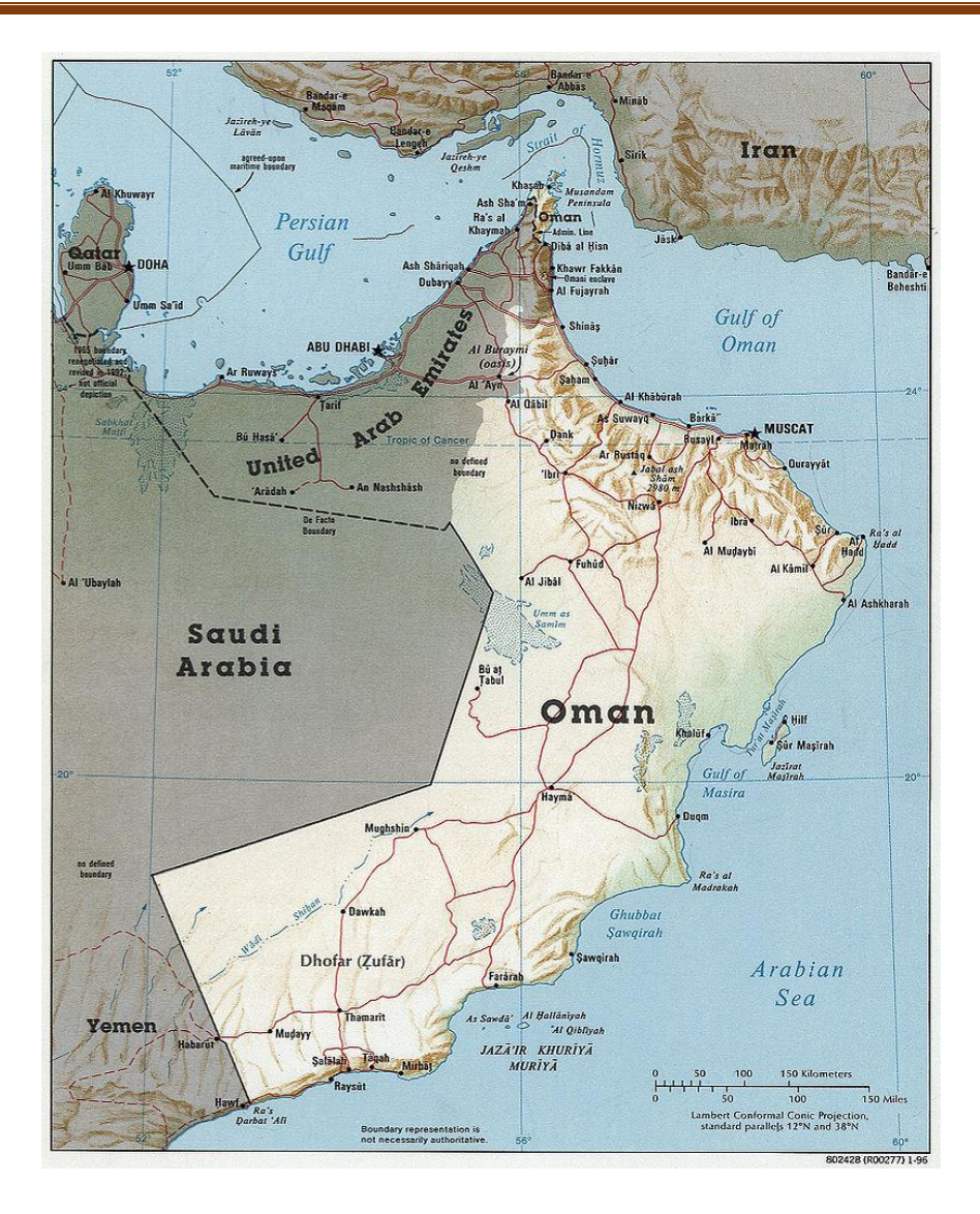
Figure 1: Map of the Sultanate of Oman (World Atlas, 2019)

As is clear from Figure 1, Oman has a long coastline that extends to 3,165km from the Strait of Hormuz in the north to the border of the Republic of Yemen, overlooking the Arabian Gulf, the Gulf of Oman, and the Arabian Sea (World Atlas, 2019).